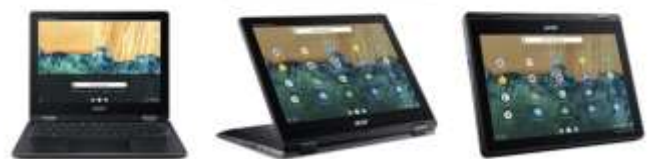
Acer Spin 512 Chromebook

The second portal will open as soon as Freedom Technology have delivered the devices purchased through the first portal, which we hope will be in the next week. We will provide details of how to order via the Link and email. So watch this space!