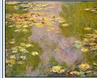
Water Lilies (1919)

- Water Lilies is one of Monet's most well-known paintings. It is a part of a series on water lilies. -It is one of his larger paintings, measuring 101 x 200cm, and is an oil-on-canvas. -At the time of producing this, Monet was already 70 years old, and mainly painted the natural beauty in his own garden and pond in Giverny. -The paintings demonstrate Monet's interest in natural beauty, and how it changes in light.