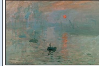
Impression, Sunrise (1872)

- Impression, Sunrise is often credited with inspiring the impressionist movement. -It shows the port of Le Harve – Monet's hometown at the time. The two small boats in the foreground and the red sun are the main subjects. -Features of industry are shown in the background, billowing chimneys and a hazy sky.