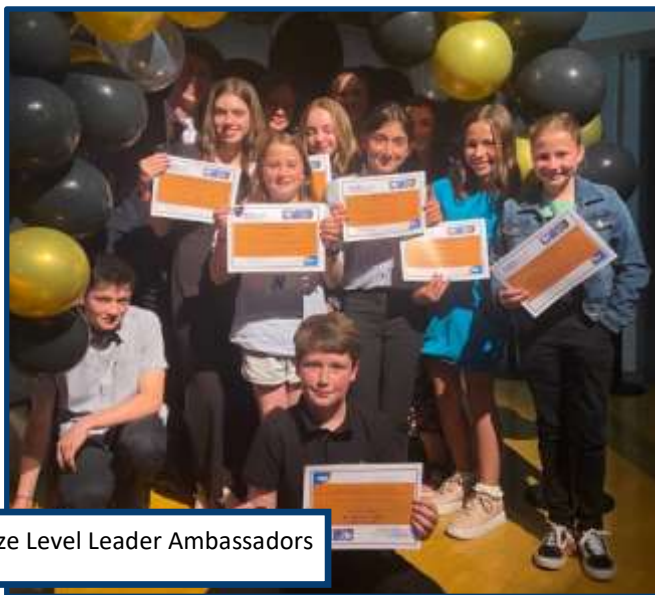
Bronze Level Leader Ambassadors