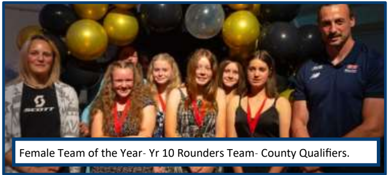
Female Team of the Year- Yr 10 Rounders Team- County Qualifiers.