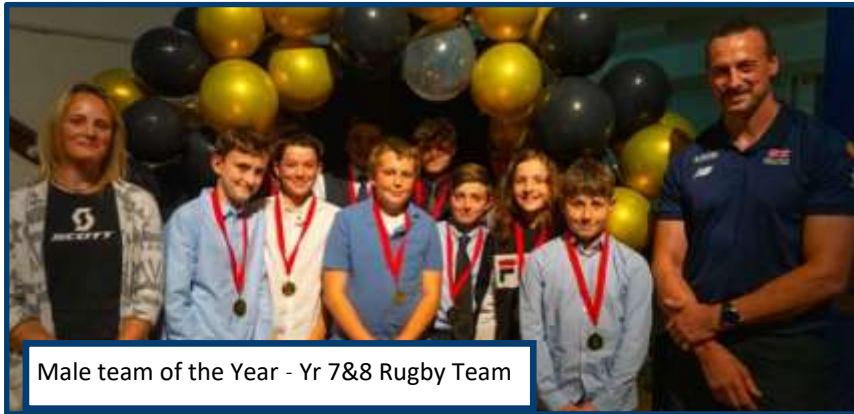
Male team of the Year - Yr 7&8 Rugby Team