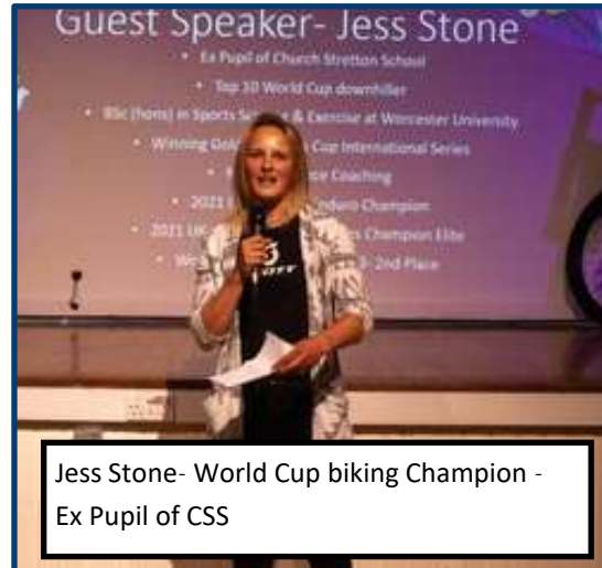
Jess Stone- World Cup biking Champion - Ex Pupil of CSS