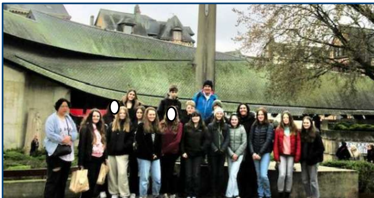
The group at the exact place Joan of Arc was burned in 1431 aged 19.