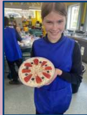
Fantastic presentation of her lemon cheesecake