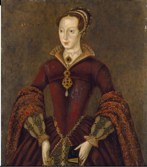
Lady Jane Grey 1553 (PROTESTANT)

Edward had no son so he left the throne to his Protestant cousin, Lady Jane Grey.