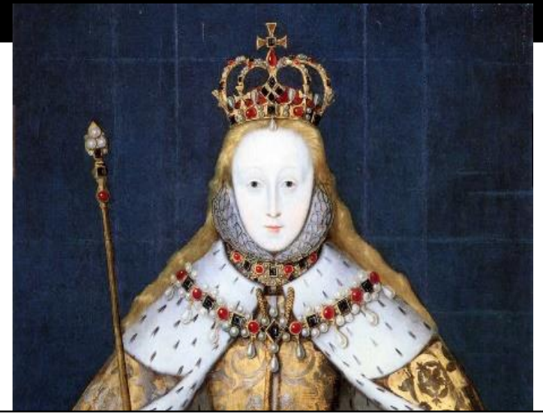
Elizabeth I 1553-1603 (PROTESTANT)

Daughter of Henry VIII and Anne Boleyn. Under Elizabeth, England became a very powerful country.