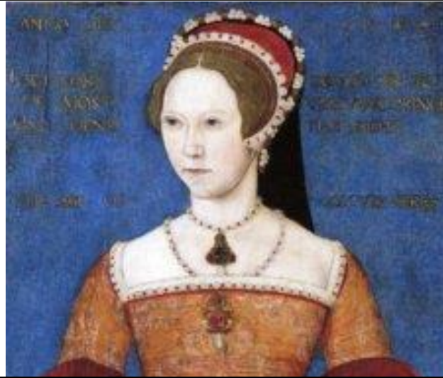
Mary I 1553-58 (CATHOLIC)

Ruled for 9 days before being overthrown by Mary. Beheaded in 1554